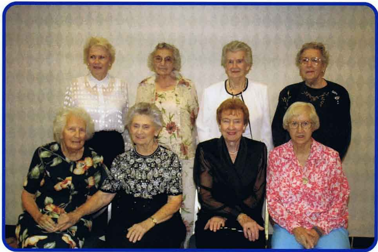
WWII Flight Nurses